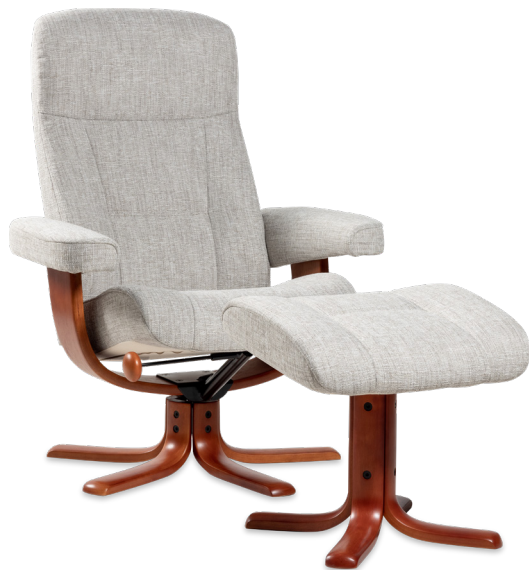
Nordic 11 W76 x D75 x H99 (M)